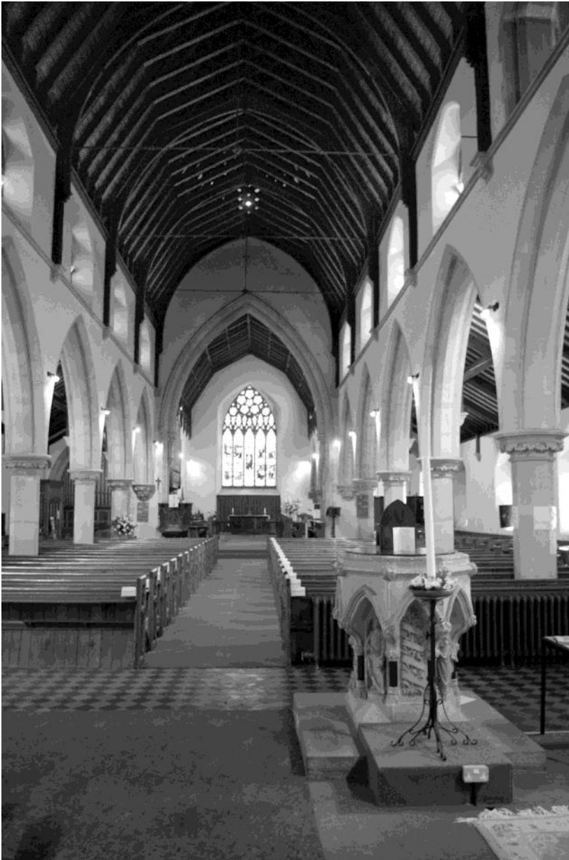
Looking east down the nave of Christ Church